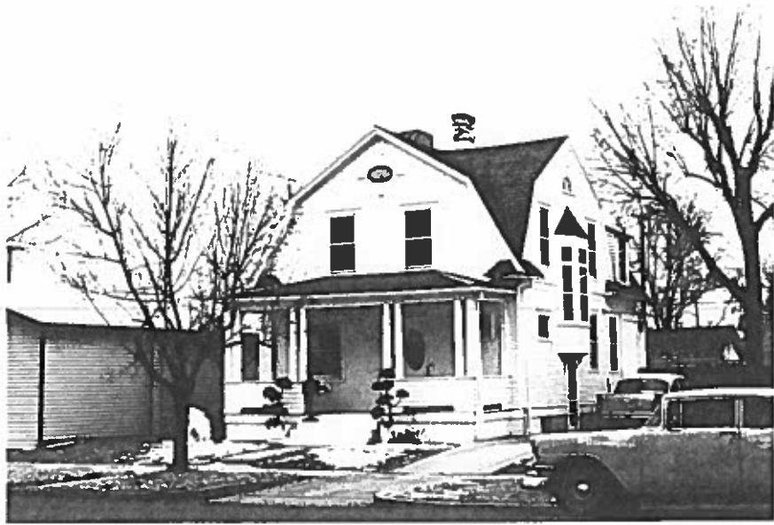
1055 Main St., Grand Junction, Mesa Co, CO 2945-144-23-006 1/30/1996 Roll 22 Frame 15 View N Dir SE 5ME7894