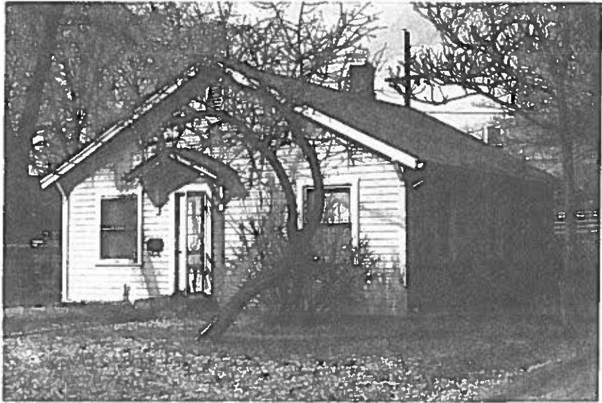
1012 Belford Ave. , Grand Junction, Mesa Co, CO 2945-141-05-012 1/29/1996 Roll 19 Frame 06 View S Dir NW 5ME7908