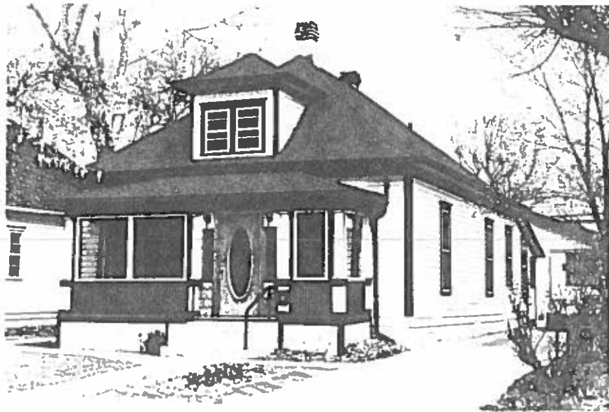
842 White Ave. (front), Grand Junction, Mesa Co, CO 2945-144-04-012 02/29/1996 Roll 32 Frame 11 View S Dir N/NW SME 8209