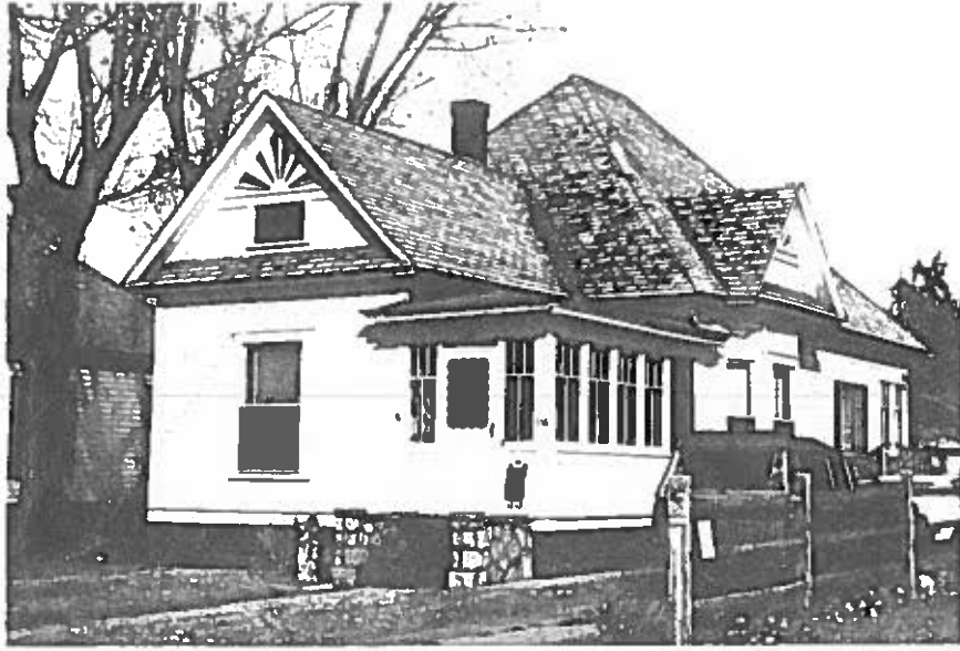
336 Chipeta Ave., Grand Junction, Mesa Co, CO 2945-142-27-012 02/05/1996 Roll 25 Frame 06 View S Dir N/NW 5ME 8215