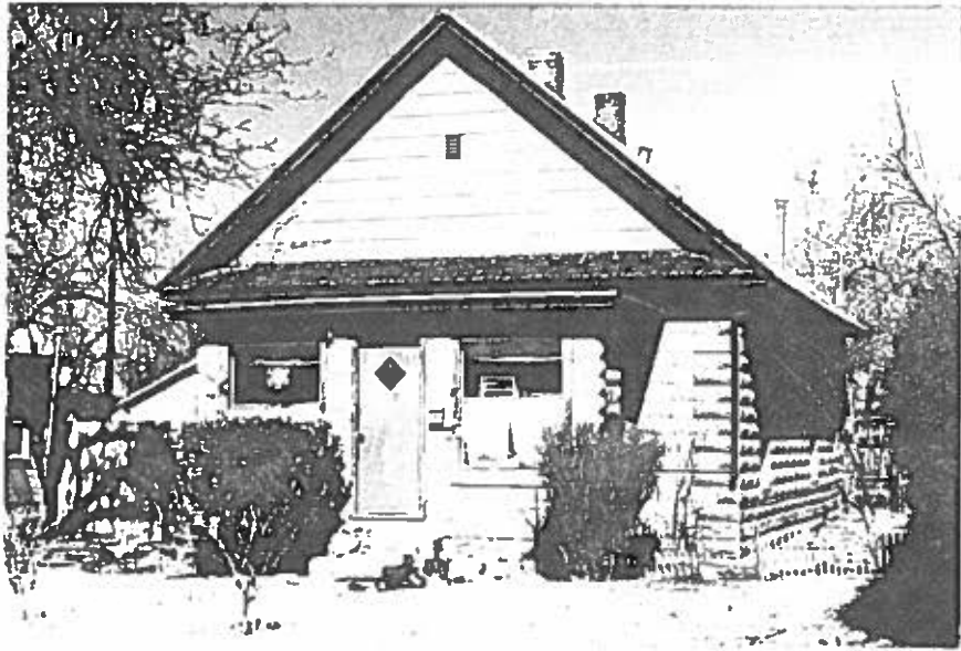
1134 Rood Ave. , Grand Junction, Mesa Co, CO 2945-144-12-017 03/08/1996 Roll 34 Frame 23 View S Dir N/NW SME8227