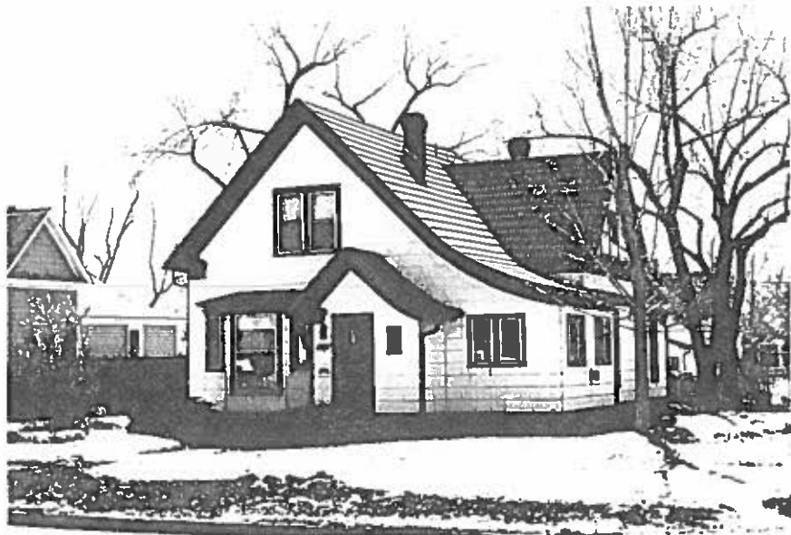
1155 Grand Ave. , Grand Junction, Mesa Co, CO 2945-144-01-007 03/08/1996 Roll 34 Frame 21 View N Dir SE 5ME8229