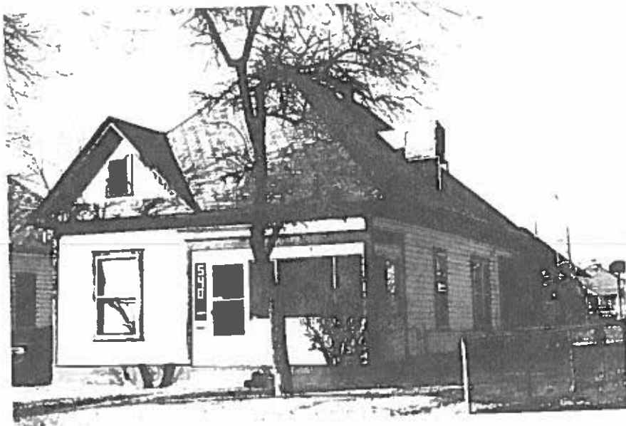
540 Teller Ave. , Grand Junction, Mesa Co, CO 2945-142-08-010 02/06/1996 Roll 28 Frame 2 View S Dir N/NE SME 8232