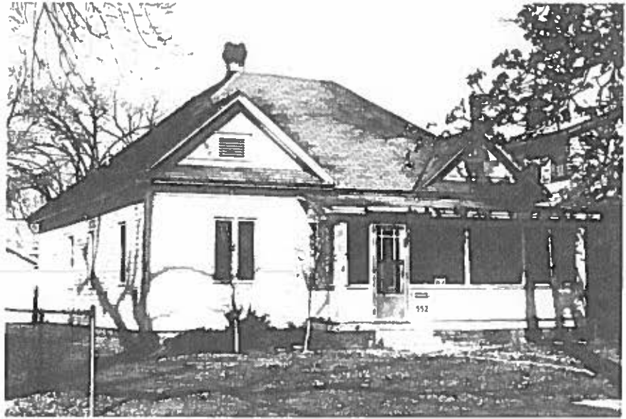
552 Teller Ave. , Grand Junction, Mesa Co, CO 2945-142-08-009 02/06/1996 Roll 28 Frame 1 View S Dir NE SME 8233