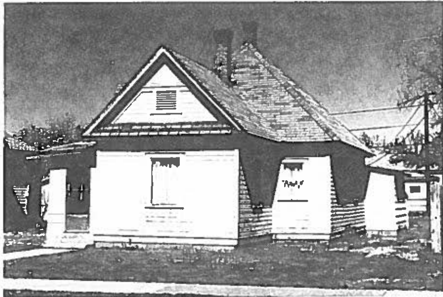
930 Rood Ave. , Grand Junction, Mesa Co, CO 2945-144-10-013 03/08/1996 Roll 34 Frame 25 View S Dir NW SME8234