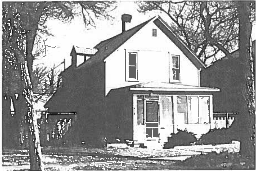
610 Chipeta Ave., Grand Junction, Mesa Co, CO 2945-142-30-008 02/05/1996 Roll 25 Frame 16 View S Dir N/NE 5ME 8236