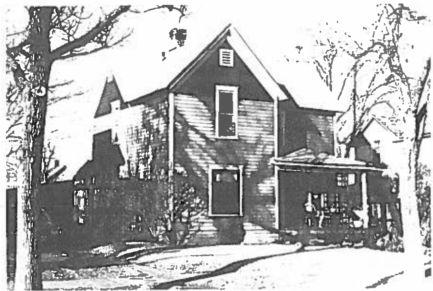
210 Chipeta Ave., Grand Junction, Mesa Co, CO 2945-142-26-018 02/05/1996 Roll 24 Frame 25 View S Dir NE 5ME 8246