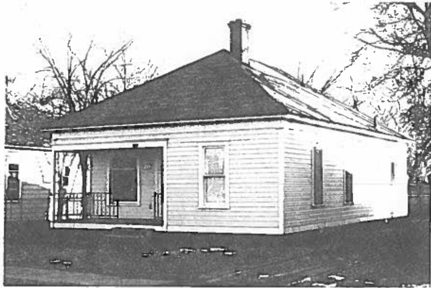
215 Chipeta Ave. , Grand Junction, Mesa Co, CO 2945-142-35-002 02/05/1996 Roll 24 Frame 24 View N Dir S/SW 5ME 8247