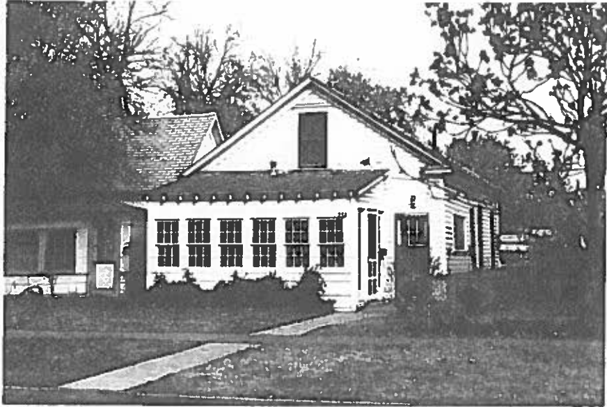
254 Chipeta Ave. , Grand Junction, Mesa Co, CO 2945-142-26-012 02/05/1996 Roll 25 Frame 01 View S Dir N/NW SME 8248