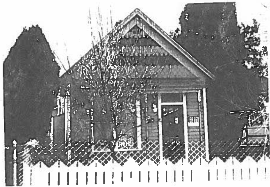
423 Chipeta Ave., Grand Junction, Mesa Co, CO 2945-142-33-008 02/05/1996 Roll 25 Frame 08 View N Dir S 5ME 8251