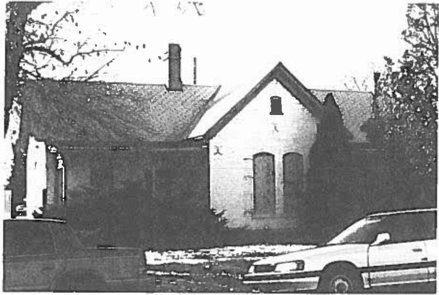
525 - 527 Chipeta Ave. , Grand Junction, Mesa Co, CO 2845-142-32-004 02/05/1996 Roll 25 Frame 12 View N Dir S/SW SME 8253