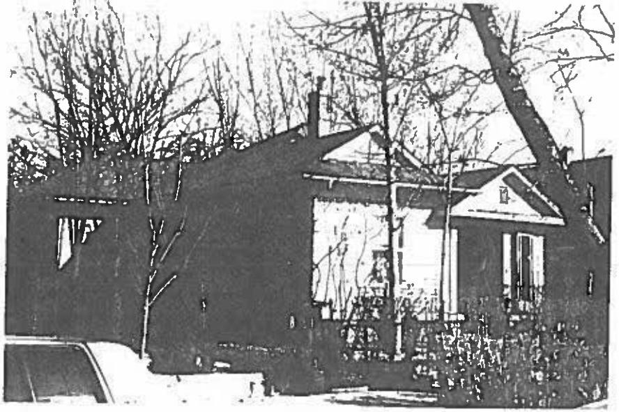
552 Chipeta Ave. , Grand Junction, Mesa Co, CO 2945-142-29-013 02/05/1996 Roll 25 Frame 14 View S Dir NE 5ME 8255