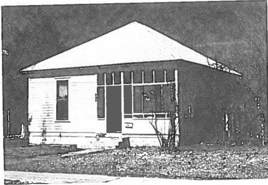
322 Hill Ave. , Grand Junction, Mesa Co, CO 2945-142-15-014 03/11/1996 Roll 38 Frame 4 View S Dir N/NW 5ME8256