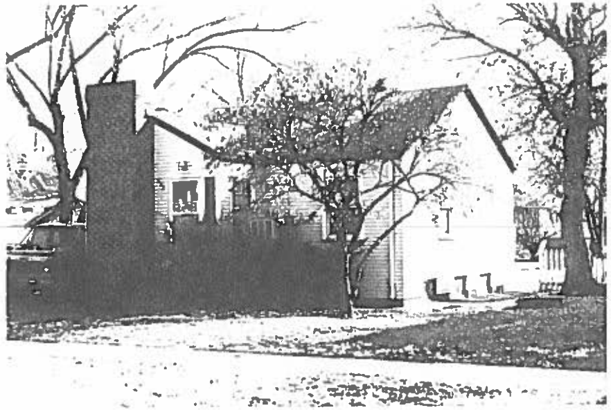
347 Teller Ave. , Grand Junction, Mesa Co, CO 2945-142-15-007 02/06/1996 Roll 28 Frame 14 View N Dir SE SME 8259