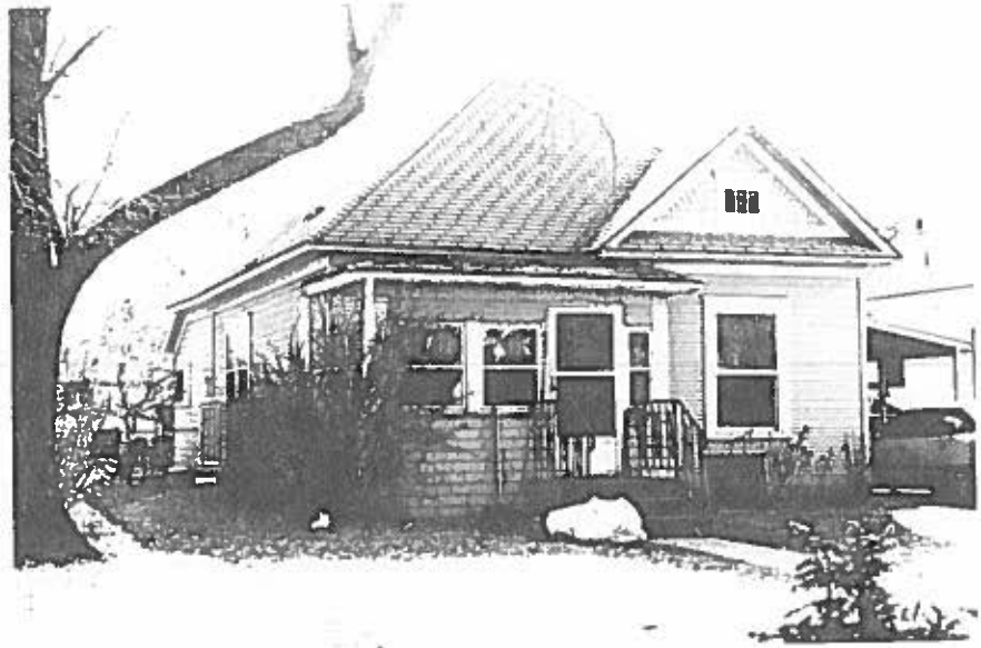
609 Teller Ave. , Grand Junction, Mesa Co, CO 2945-142-18-002 02/06/1996 Roll 27 Frame 22 View N Dir S/SW SME 8262