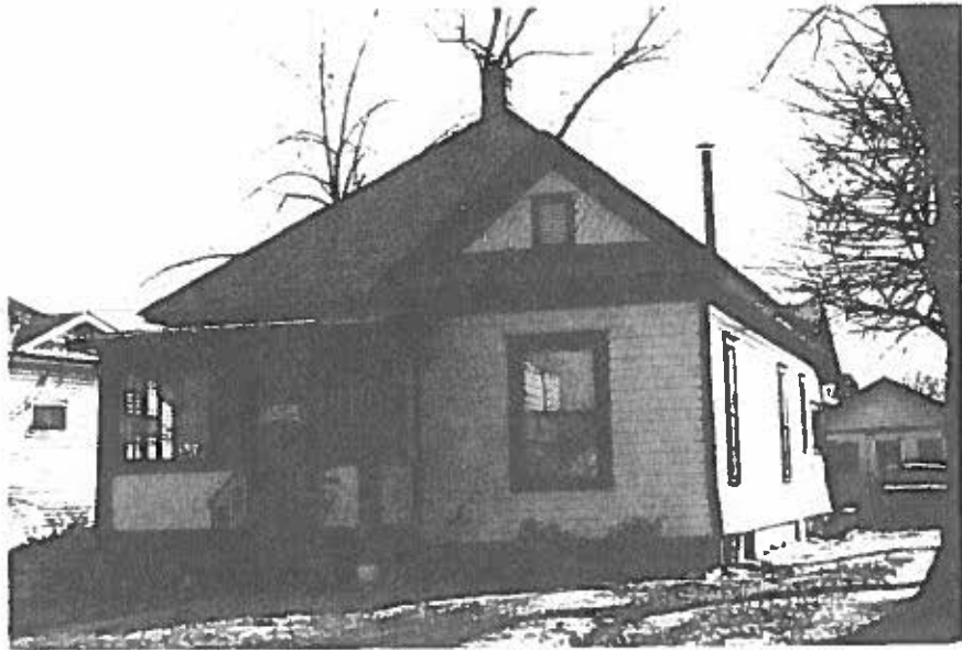
617 Teller Ave. , Grand Junction, Mesa Co, CO 2945-142-18-003 02/06/1996 Roll 27 Frame 21 View N Dir S/SE 5 ME 8263