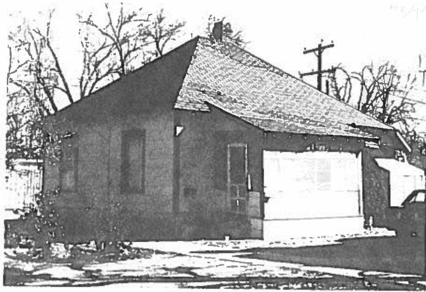
518 N. 2nd St., Grand Junction, Mesa Co, CO 2945-142-35-017 03/11/1996 Roll 36 Frame 3 View S Dir NE SME 8247