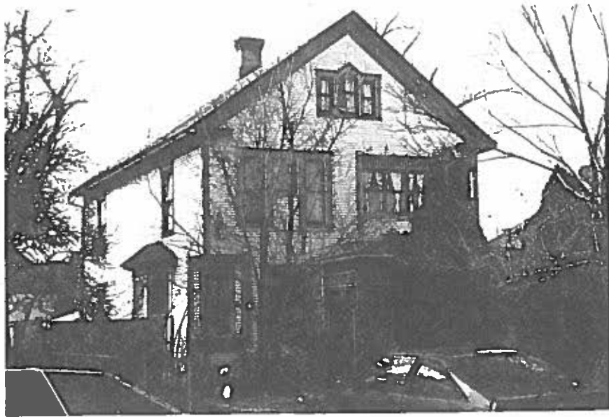
625 Chipeta Ave. (Front), Grand Junction, Mesa Co, CO 2945-142-31-004 02/05/1996 Roll 25 Frame 18 View N Dir S/SW 5ME 8280