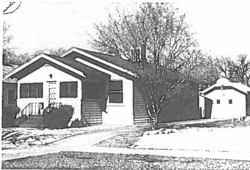
320 Gunnison Ave. , Grand Junction, Mesa Co, CO 2945-142-22-013 02/06/1996 Roll 26 Frame 16 View N Dir NW JME 8281