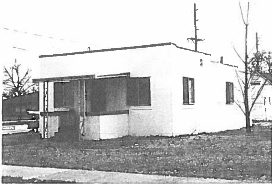
637 Belford Ave., Grand Junction, Mesa Co, CO 2945-142-07-005 02/07/1996 Roll 30 Frame 9 View N Dir S/SE SME 8306