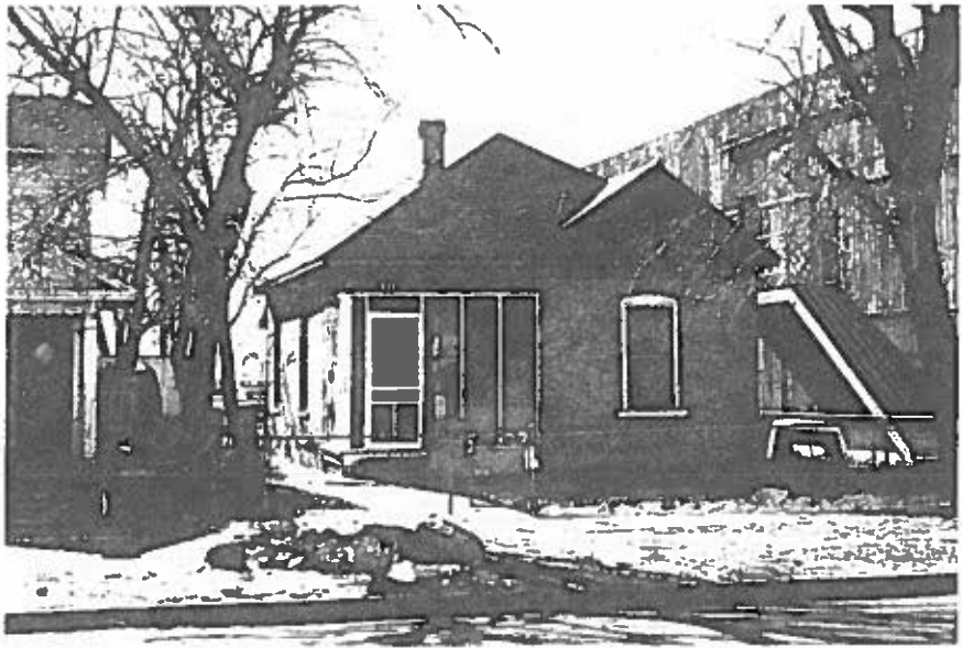
221 Pitkin Ave. , Grand Junction, Mesa Co, CO 2945-143-37-002 01/12/1996 Roll 19 Frame 03 View N Dir S/SW 5ME7767