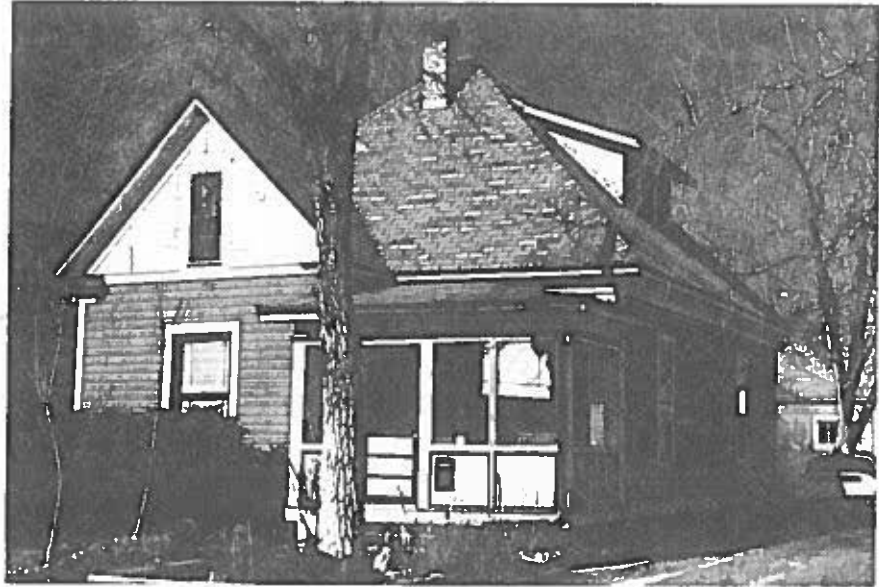
1114 White Ave. Grand Junction, Mesa Co, CO 2945-144-01-010 SME7773