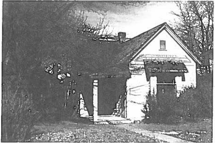
1020 Rood Ave. (Front) Grand Junction, Mesa Co, CO 2945-144-11-013 SME7793