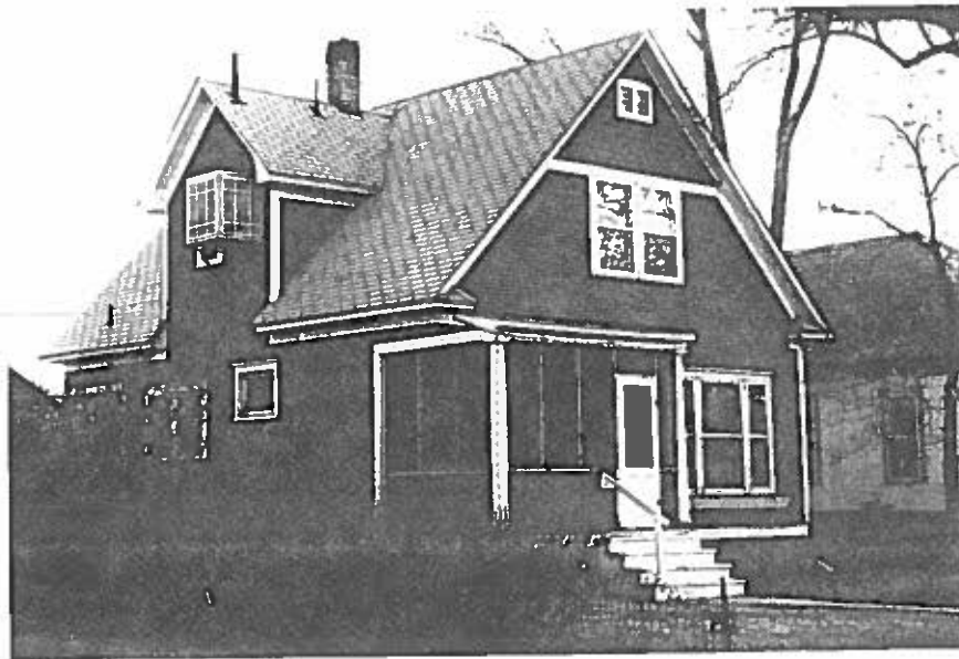
1133 Ouray Ave. , Grand Junction, Mesa Co, CO 2945-141-42-005 02/29/1996 Roll 34 Frame 16 View N Dir SW 5ME7843