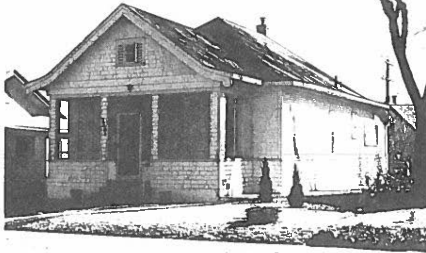
1151 Ouray Ave. , Grand Junction, Mesa Co, CO 2945-141-42-007 02/29/1996 Roll 34 Frame 14 View N Dir S/SE SME7844