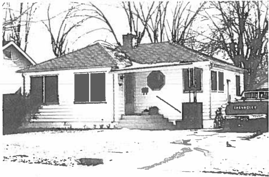
927 Teller Ave. , Grand Junction, Mesa Co, CO 2945-141-16-004 1/29/1996 Roll 19 Frame 09 View N Dir SW 5ME7878