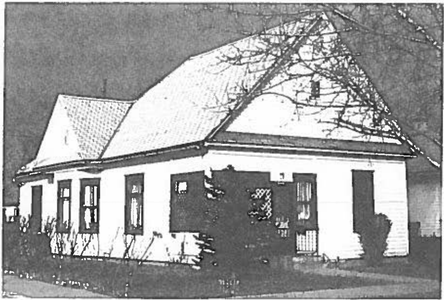
1102 Chipeta Ave. , Grand Junction, Mesa Co, CO 2945-141-30-010 1/29/1996 Roll 20 Frame 05 View S Dir NE SME7880