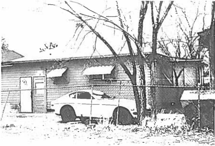
822 Rood Ave. (Rear), Grand Junction, Mesa Co, CO 2945-144-09-011 1/30/1996 Roll 22 Frame 13 View S Dir NE 5M7881