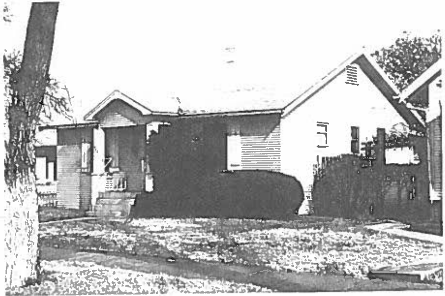
950 N. 8th St., Grand Junction, Mesa Co, CO 2945-141-10-001 1/29/1996 Roll 19 Frame 15 View W Dir NE 5ME7883