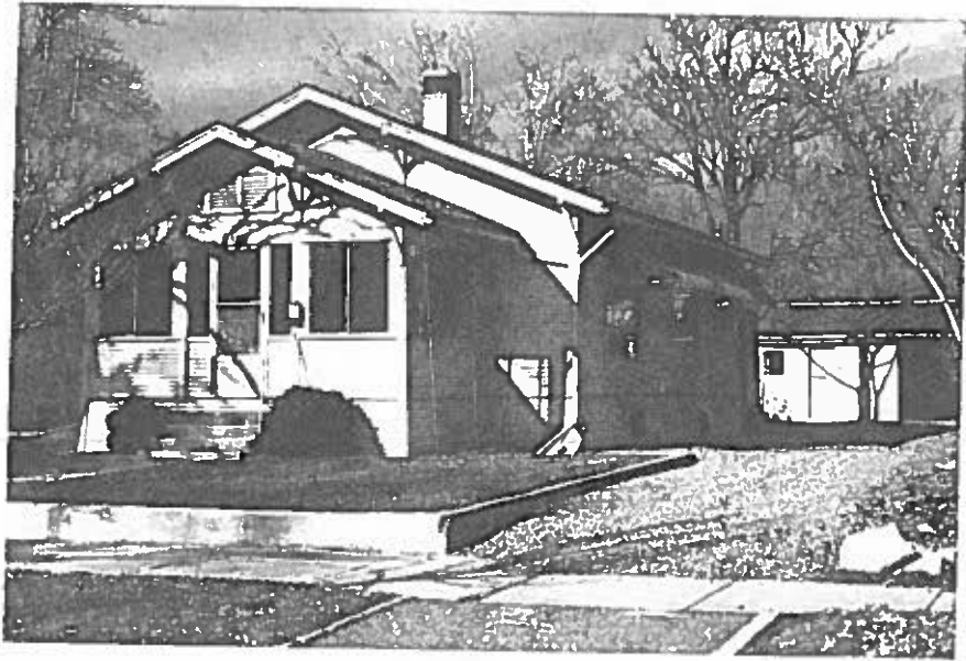
856 Teller Ave. , Grand Junction, Mesa Co, CO 2945-141-10-015 1/29/1996 Roll 19 Frame 11 View S Dir N/NW SME7895