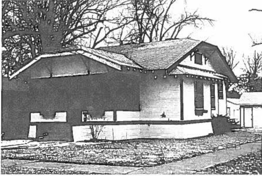
1103 Hill Ave., Grand Junction, Mesa Co., CO 2945-141-19-001 03/21/1996 Roll 19 Frame 22 View N Dir SE 5ME7901