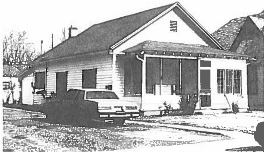
626 Gunnison Ave. (front), Grand Junction, Mesa Co, CO 2945-142-19-007 02/06/1996 Roll 26 Frame 10 View S Dir N/NE 5ME 8159 5ME 8160