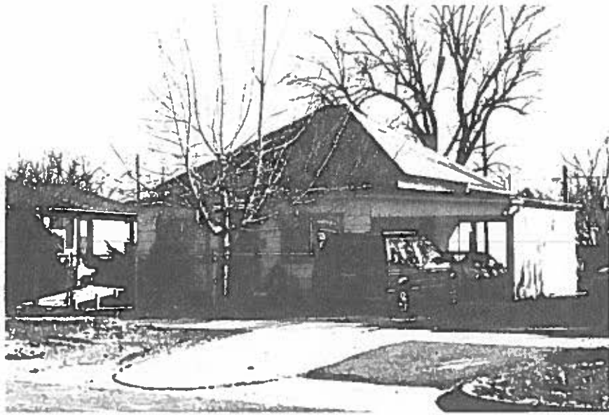
235 Teller Ave. , Grand Junction, Mesa Co, CO 2945-142-14-005 02/06/1996 Roll 28 Frame 23 View N Dir S/SW 5ME 8162