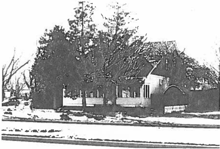
805 N. 7th St., Grand Junction, Mesa Co, CO 2945-141-13-004 02/05/1996 Roll 23 Frame 9 View E Dir W/SW SME 8171