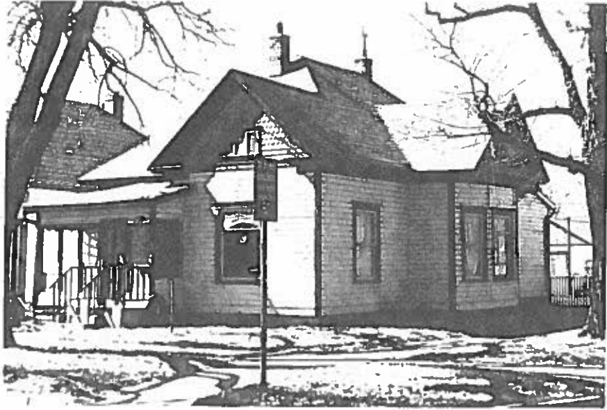
739 N. 7th St., Grand Junction, Mesa Co, CO 2945-141-24-001 03/11/1996 Roll 37 Frame 16 View E Dir SW 5ME @172