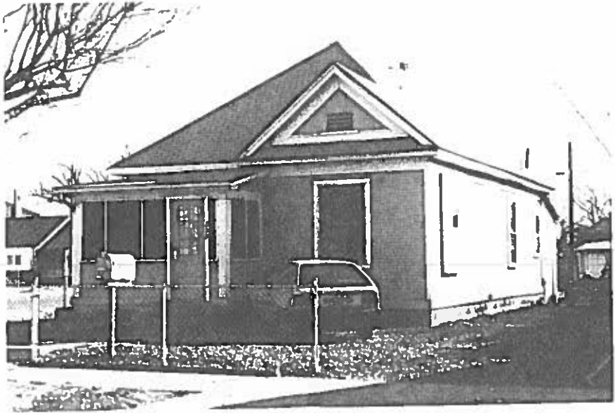
259 Teller Ave. , Grand Junction, Mesa Co, CO 2945-142-14-008 02/06/1996 Roll 28 Frame 21 View N Dir S/SW SME 8177