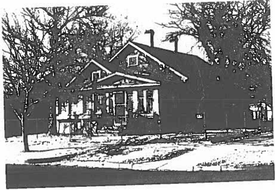
260 Teller Ave. , Grand Junction, Mesa Co, CO 2945-142-11-009 02/06/1996 Roll 28 Frame 20 View .S Dir N/NW 5ME 8178