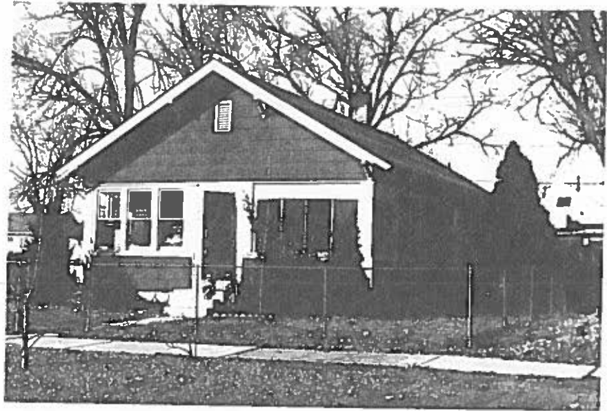
304 Teller Ave. , Grand Junction, Mesa Co, CO 2945-142-10-016 02/06/1996 Roll 28 Frame 19 View S Dir N/NW SME 8179