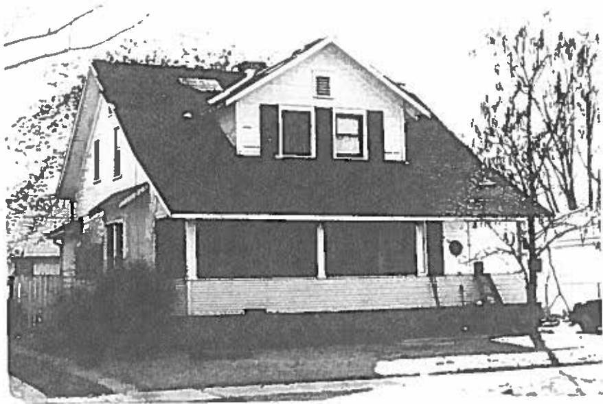
411 Teller Ave. , Grand Junction, Mesa Co, CO 2945-142-16-002 02/06/1996 Roll 28 Frame 11 View N Dir S/SW SME 8182