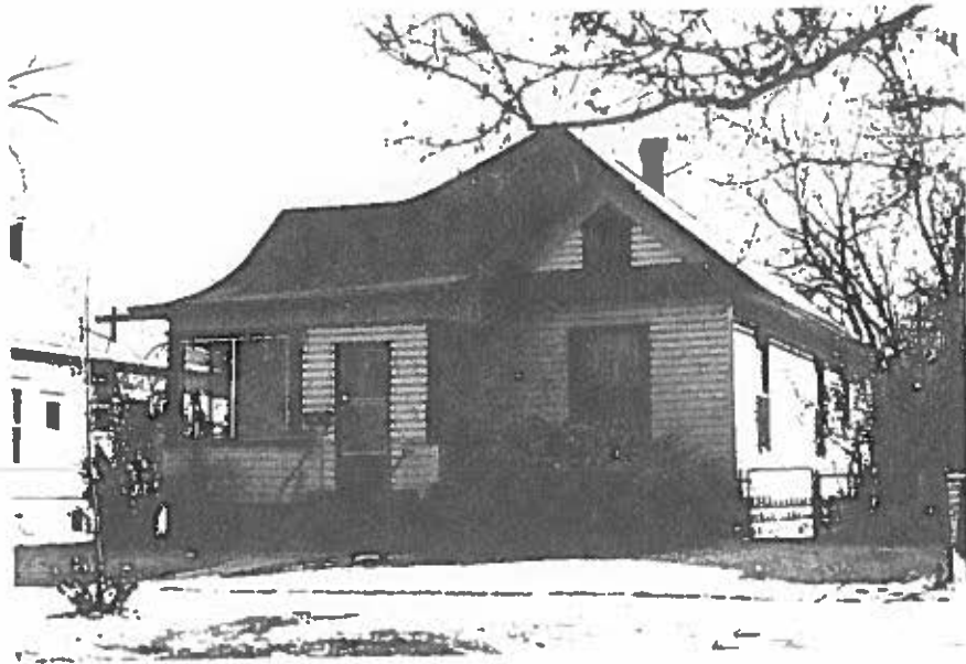
443 Teller Ave. , Grand Junction, Mesa Co, CO 2945-142-16-005 02/06/1996 Roll 28 Frame 6 View N Dir S/SE 5ME 8185