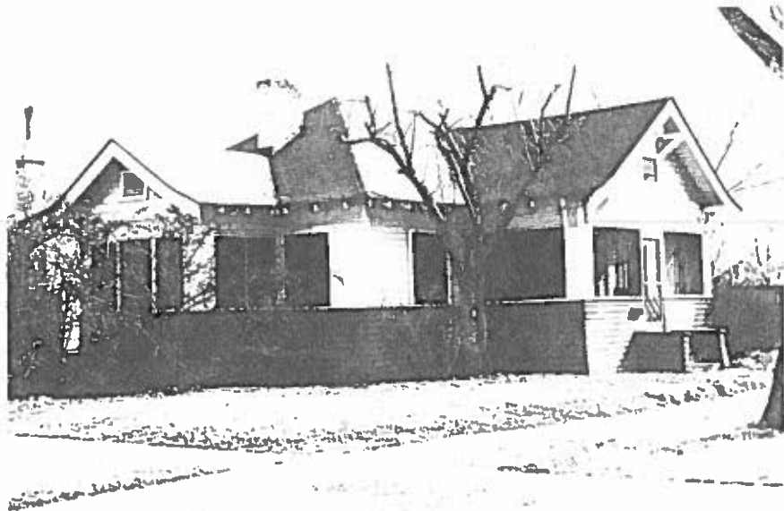
730 N. 6th St., Grand Junction, Mesa Co, CO 2945-142-19-001 02/06/1996 Roll 27 Frame 13 View W Dir SE 5ME 8186