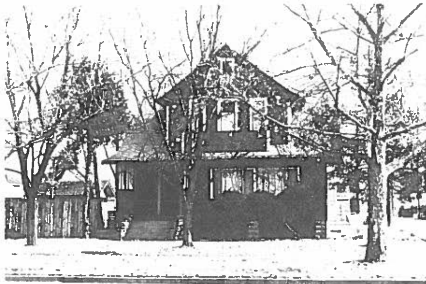
724 N. 5th St., Grand Junction, Mesa Co, CO 2945-142-20-002 02/06/1996 Roll 26 Frame 5 View W Dir E 5ME 8188