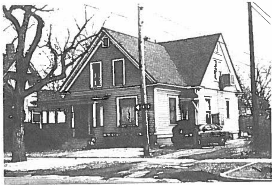
630 N. 5th St., Grand Junction, Mesa Co, CO 2945-142-29-021 02/05/1996 Roll 25 Frame 23 View W Dir NE SME 8189