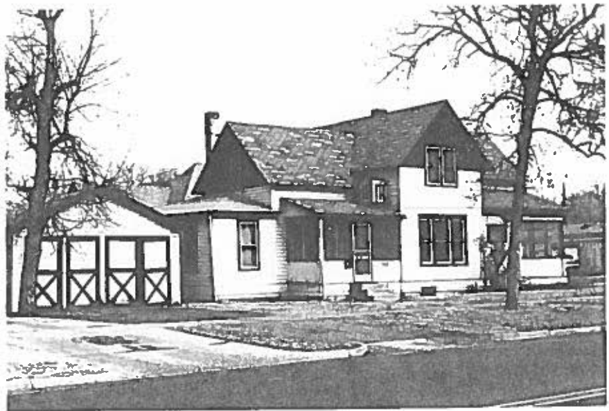
552 Gunnison Ave., Grand Junction, Mesa Co, CO 2945-142-20-011 02/06/1996 Roll 26 Frame 7 View S Dir NE SME 8191