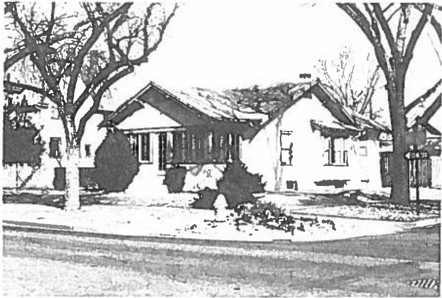
908 N. 5th St., Grand Junction, Mesa Co, CO 2945-142-08-014 02/06/1996 Roll 28 Frame 5 View W Dir NE SME 8192