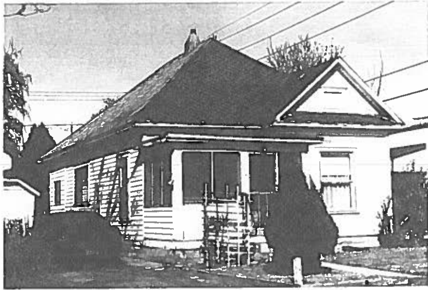
634 Teller Ave. , Grand Junction, Mesa Co, CO 2945-142-07-006 02/06/1996 Roll 27 Frame 19 View S Dir N/NE SME 8195